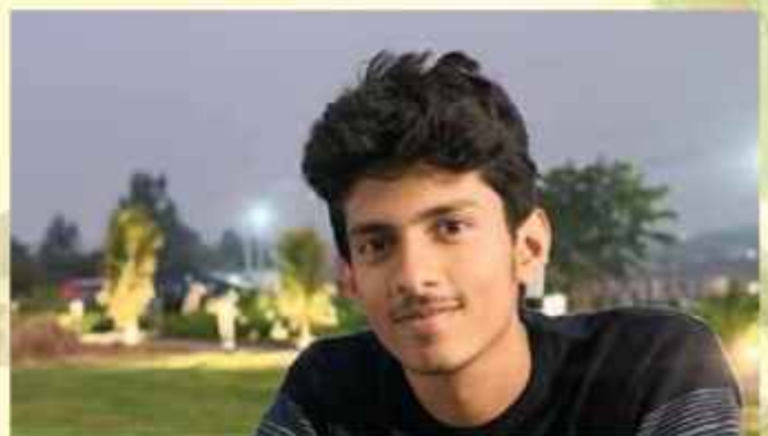
VISHAL SINGER - Tv Fame