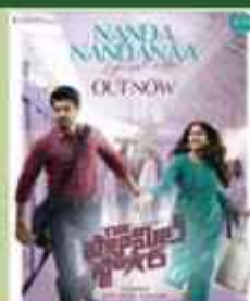
THE FAMILY STAR