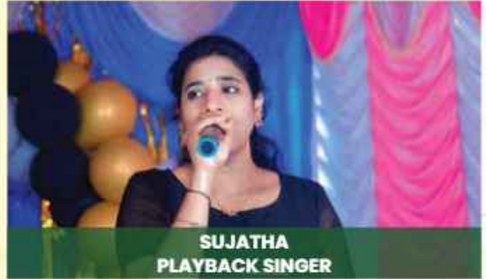
SUJATHA PLAYBACK SINGER