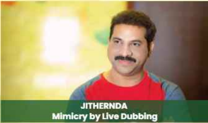
JITHERNDA Mimicry by Live Dubbing