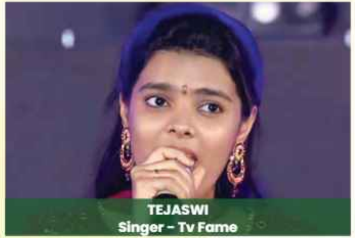
TEJASWI Singer - Tv Fame