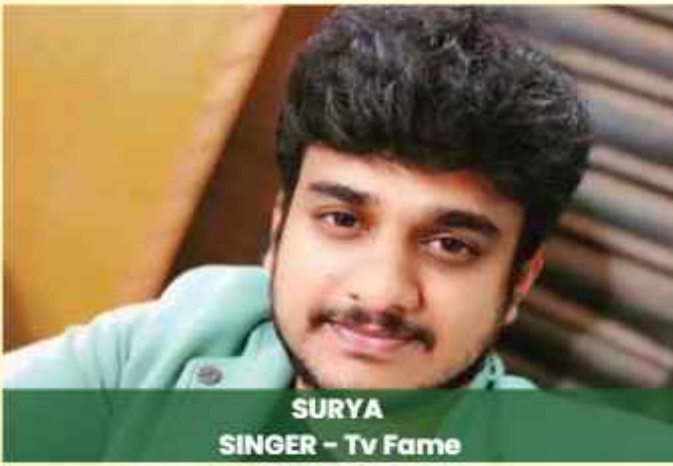
SURYA SINGER - Tv Fame