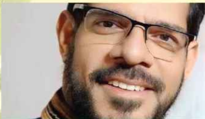
SIMHA (FILM FARE AWARD WINNER)

We look forward to your presence and participation in this joyous celebration!