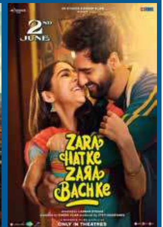
ZARA HATKE ZARA BACHKE