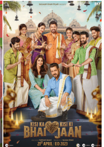
KISI KA BHAI KISIKI JAAN (HINDI)